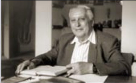
Professor Ilya Prigogine, Nobel Prize Winner

The 2010 award ceremony will be held during The Sustainable City 2010.