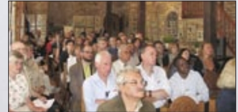
Delegates at the Prigogine Award 2008